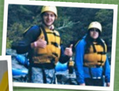
White Water Rafting with Wilderness Tours, Foresters Falls, ON