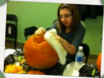
A visit to Nightmares Haunted House Goth Girl Pumpkin carving